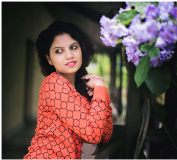
Avismita Bhattacharya Best Female Photographer